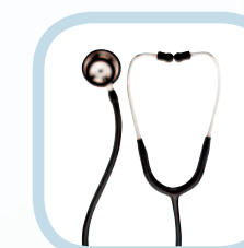
PROFESSIONAL ADULT STETHOSCOPE 5079-135