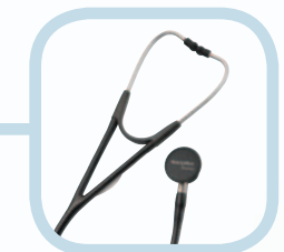
HARVEY ELITE DOUBLE-HEAD STETHOSCOPE 5079-125