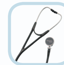
HARVEY DLX DOUBLE-HEAD STETHOSCOPE 5079-325