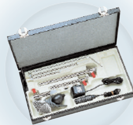
35303 Fiber Optic Sigmoidoscope Set